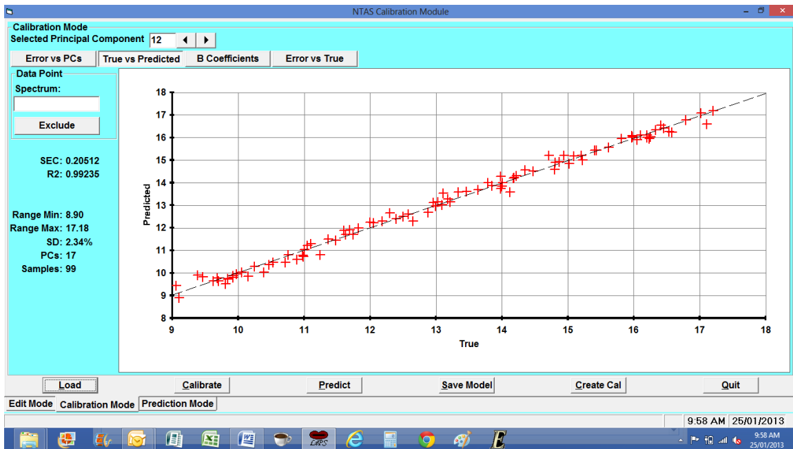
Figure 2. Calibration Plot for Protein

Figures 2, 3, 4 and 5 show the calibration plots and statistics for protein, moisture, oil and crude fibre respectively.